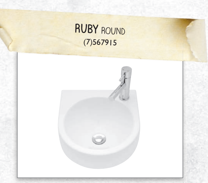
W 360mm, L 375mm, H 150mm

With a flat edge design and styling ensuring the right balance between shape and form.